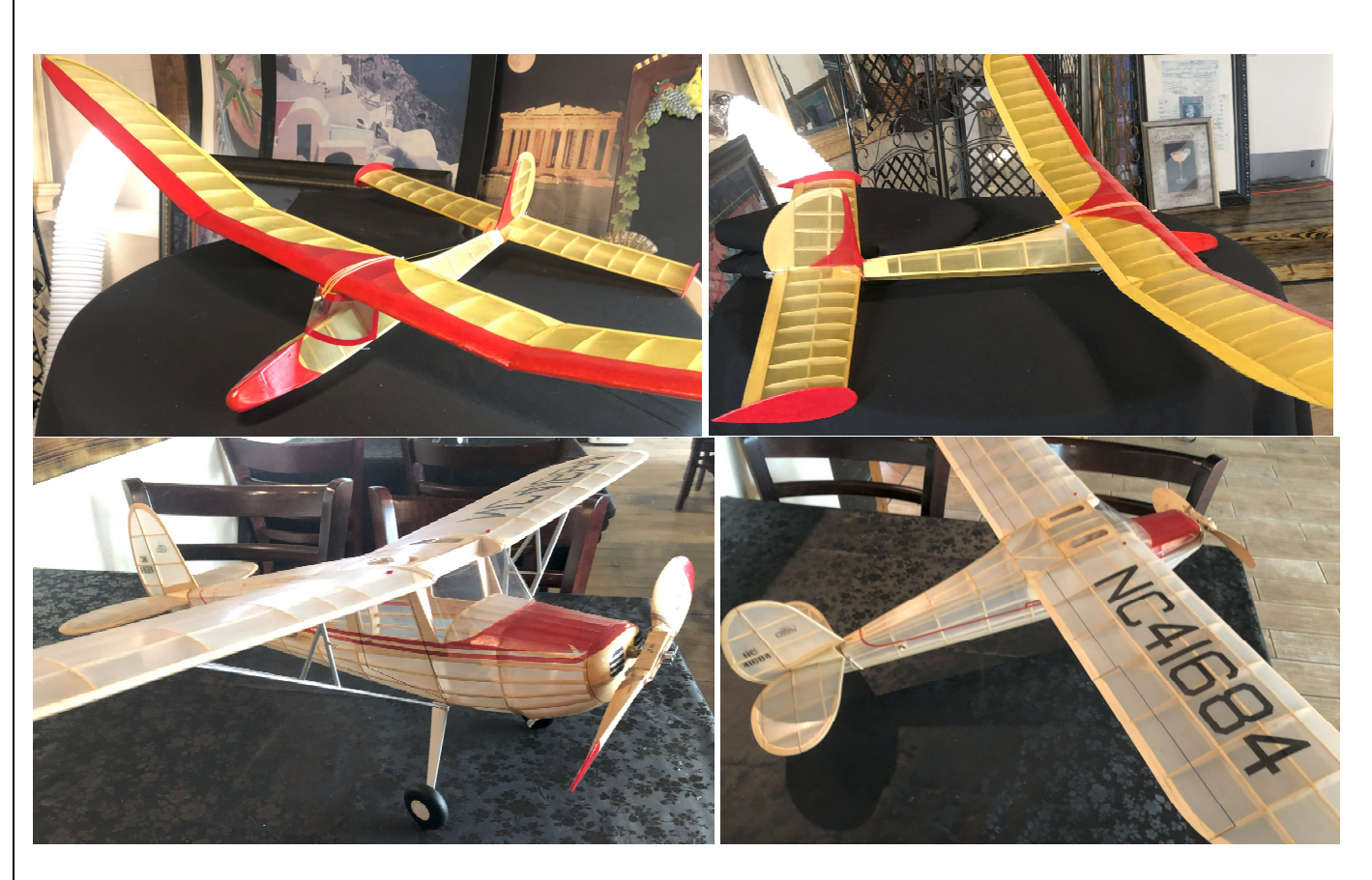
Last Issues MISSING Photos!!!!