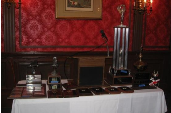
TTOMA's Mahogany Row