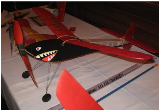
Belle of the Ball, Dohrman's Hi-Climber