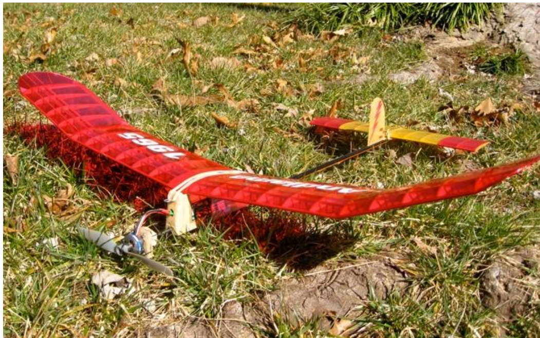
Dohrman’s upgraded Sparks for new E-36 rules. Same weight, lots more power.