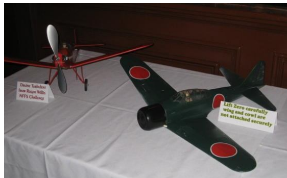
Barf's Turbulent and Zero, still no prop