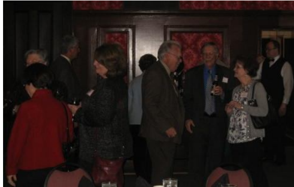
How we roll, but nobody did The Cockroach