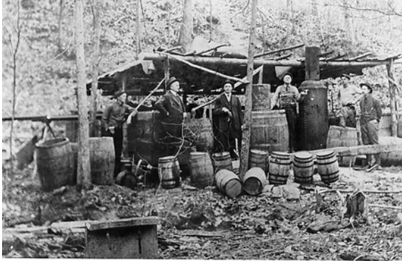
Boozy's aunt's Modern Laboratory and Laboratory Staff

"Break a leg," muttered Boozy as he offered the bottle to Maryanne.