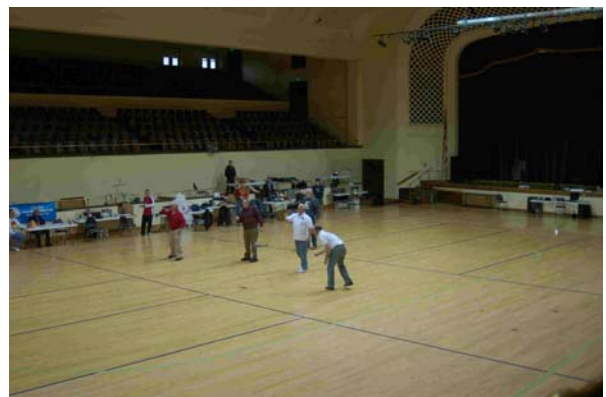
No-Cal WW 2 Mass Launch