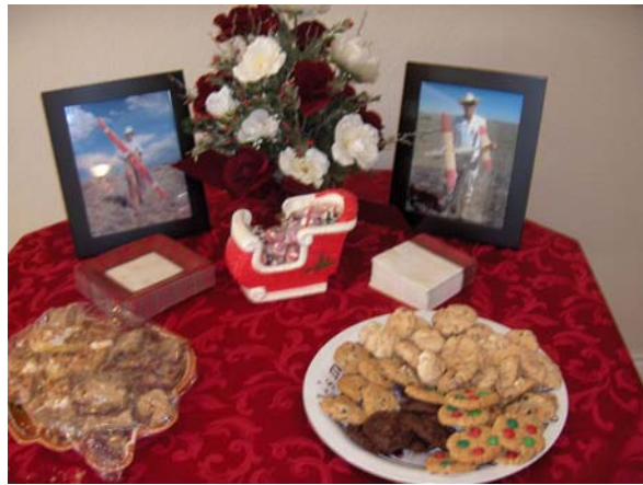
The table of honor for Art and Willard