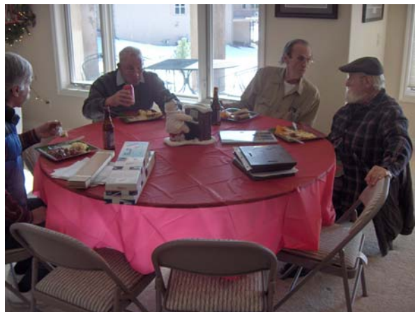
BBQ and Beer make for a great mixer